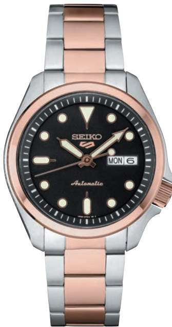
SRPE58 $325 Rose gold finish