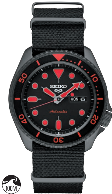
SRPD83 $335 Black ion finish Nylon strap