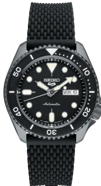
SRPE23 $335 Black ion finish Silicone strap