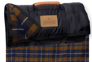
XR334-53851 Douglas Tartan