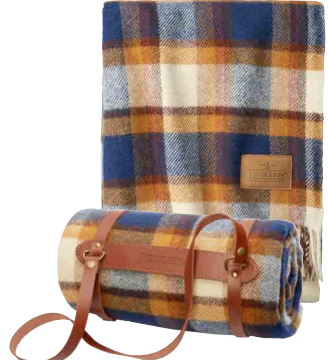
ZC333-53850 Steens Mountain