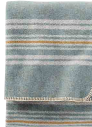
ZB219-53780 Irving Stripe, Shale