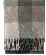
ZB215-52959 Juniper / Fawn

PENDLETON ECO-WISE WOOL® Wool is an environmentally friendly and naturally renewable fiber. This fabric can be recycled or composted as a healthy additive to the soil. The ingredients and manufacturing process meet or exceed the sustainability criteria. Our goal is to manufacture wool in a way that leaves the smallest possible footprint on the earth.