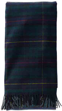
ZB296-53847 Albany Tartan