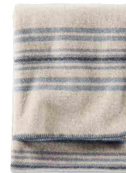
ZB219-53773 Irving Stripe, Taupe