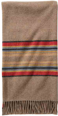
ZB296-53575 Mineral Umber