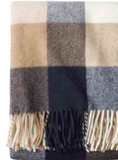
ZB215-53879 Navy / Camel