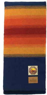
ZF133-50750 Grand Canyon