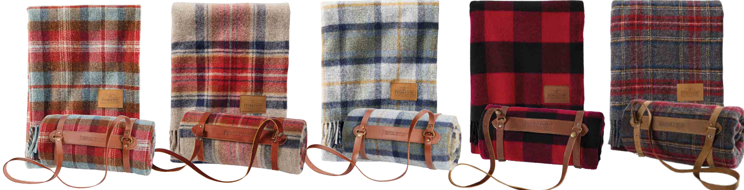
ZC333-53760 Ruby Beach