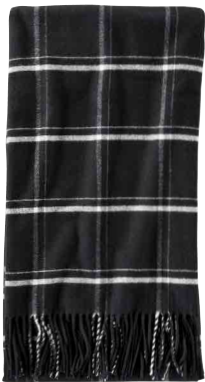
ZB296-53770 Black Windowpane