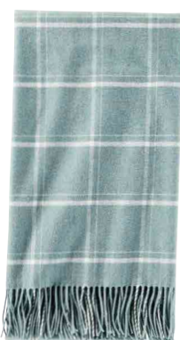
ZB296-53771 Shale Windowpane