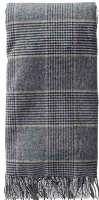
ZB296-53849 Dundee Plaid