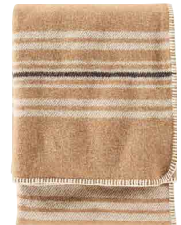
ZB219-53781 Irving Stripe, Camel