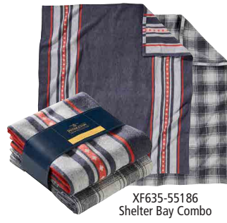
XF635-55186 Shelter Bay Combo