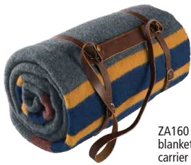
ZA160 Twin blanket with carrier