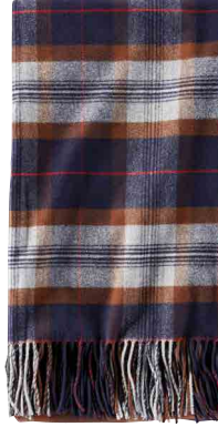
ZB296-53768 Ecliptic Plaid