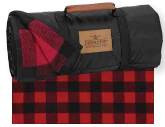
XR334-53086 Rob Roy