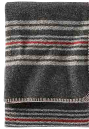
ZB219-53782 Irving Stripe, Charcoal