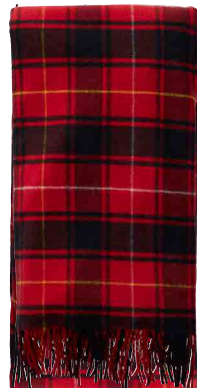
ZB296-53848 MacIver Tartan