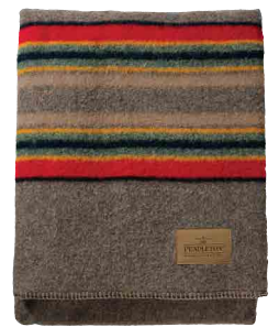
52553 Mineral Umber