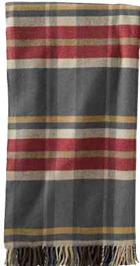
ZB296-52797 Breslin Plaid