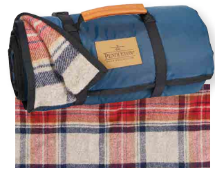
XR334-53589 Vintage Dress Stewart