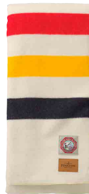
ZF133-50717 Glacier Not available in Canada.