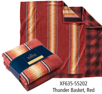
XF635-55202 Thunder Basket, Red