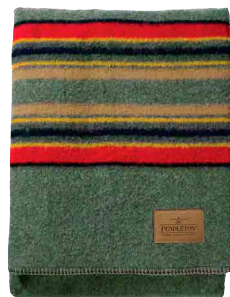
50053 Green Heather