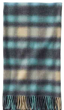
ZB296-53405 Ocean Ombre