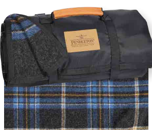
XR334-53587 Summit Lake