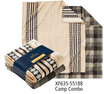
XF635-55188 Camp Combo