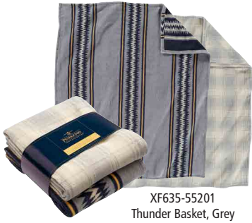
XF635-55201 Thunder Basket, Grey