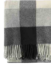
ZB215-52956 Black / Ivory