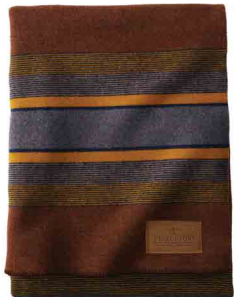
53764 High Ridge