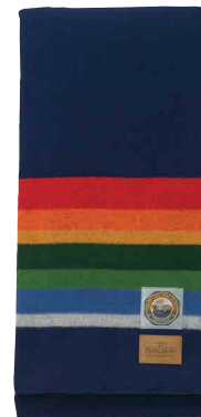
ZF133-50738 Crater Lake