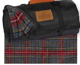
XR334-52453 Charcoal Stewart