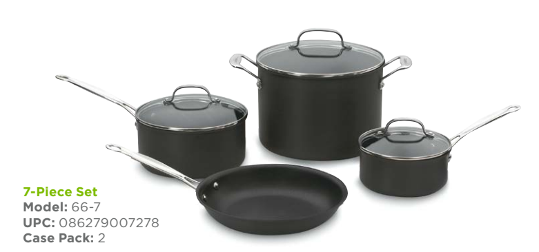
Set Includes: 1\frac{1}{2} Qt. Saucepan with cover, 3 Qt. Saucepan with cover, 8 Qt. Stockpot with cover, 10^{\prime\prime} Skillet