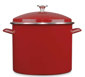
Case Pack: 2