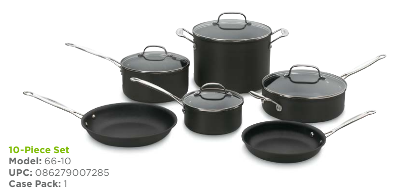
Set Includes: 1½ Qt. Saucepan with cover, 3 Qt. Saucepan with cover, 3½ Qt. Sauté Pan with helper handle and cover, 8 Qt. Stockpot with cover, 8" Skillet, 10" Skillet